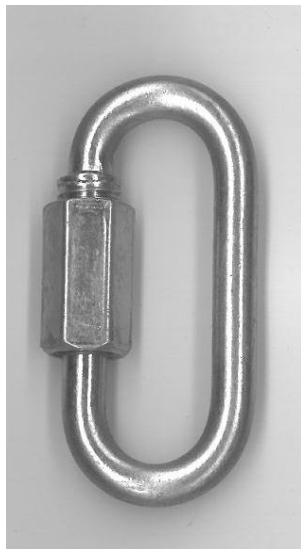
1/4" QUICK LINK