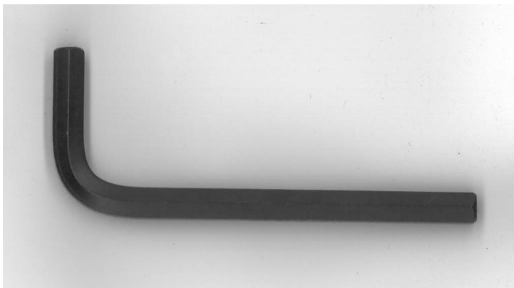
5/16 ALLEN WRENCH (RED BAG)